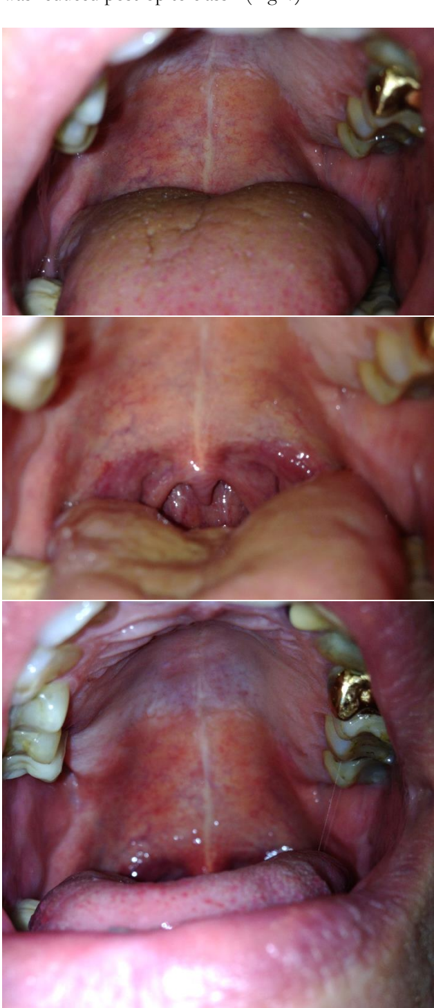
Fig. 7: Patient no. 5 a) pre-op, class IV, b) post-op Tx3, class I, c) RC 36 months post-op, class II

The patient was a 56-year-old male with moderate OSA; relationship problems, sleeping problems, sore throat and morning headaches. Mallampati class IV was reduced post-op to class I (Fig. 7).