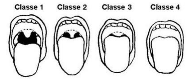
Class 1: Full visibility of tonsils, uvula and soft palate Class 2: Visibility of hard and soft palate, upper portion of tonsils

Class 3: Soft and hard palate and base of the uvula are visible Class 4: Only hard palate visible