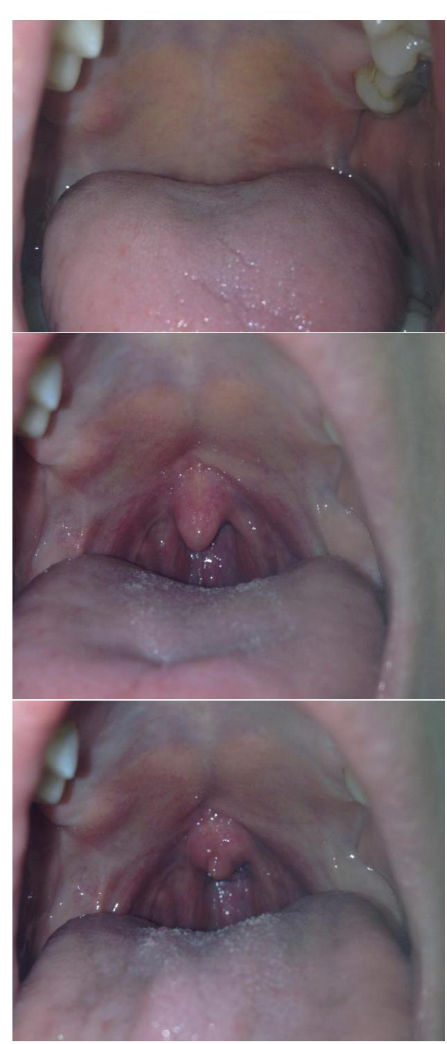
Fig. 5: Patient no. 3 a) pre-op, class IV, b) post-op Tx3, class I, c) RC 36 months post-op, class I

The patient was a 30-year-old male and former ice-hockey player; lately not able to exercise at all – out of breath immediately; severe OSA. He had been using a CPAP mask now for two years with discomfort. Mallampati class IV was reduced post-op to class I (Fig. 5).