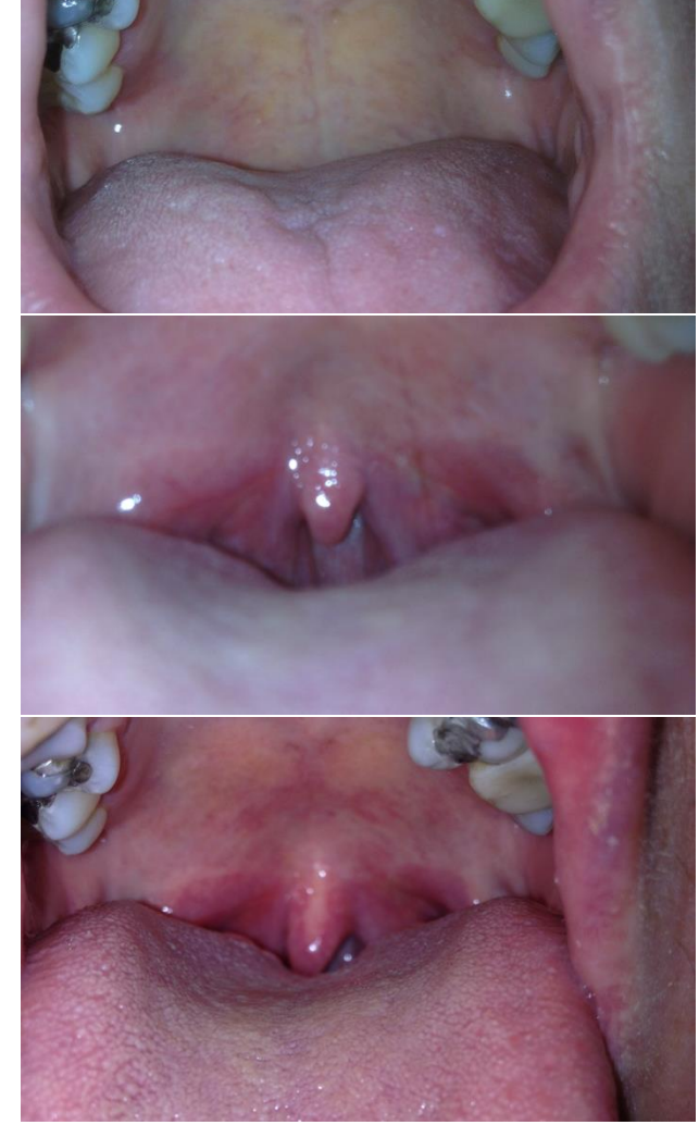
Fig. 3: Patient no. 1 a) pre-op class IV, b) post-op Tx3, class I, c) RC 36 months post-op, class II

The patient was a 46-year-old female patient. Medical anamnesis revealed severe OSA with related headaches and daytime drowsiness. Intraoral examination showed Mallampati class IV. The result post-op showed class I (Fig. 3).