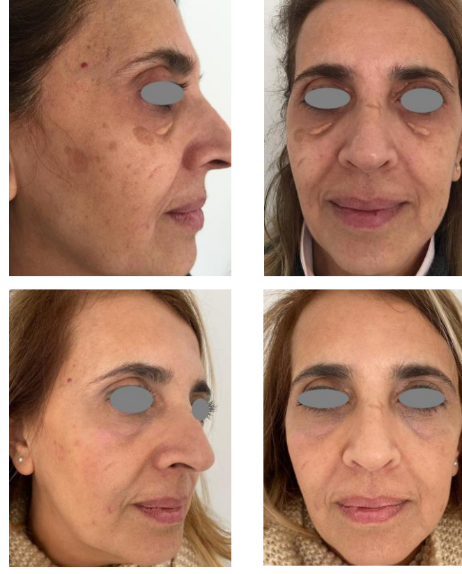
Before and after the treatment

Following the 4D laser treatment, we removed the pigmentations and xanthelasmata until bleeding occurred. We used Nd:YAG with the above-mentioned parameters for telangiectasia. Following the treatment, we recommended the use of 2% fusidic acid topical cream, Fito cream, moisturizer, and 50 SPF, as well as to clean her face with saline solution and a sponge during the day 2-10 post treatment period. Following the procedure, the patient was monitored weekly and, as can be seen from the follow up picture taken after 2 weeks, the xanthelasmata were almost completely cleared and pigmentation in the cheeks was removed.