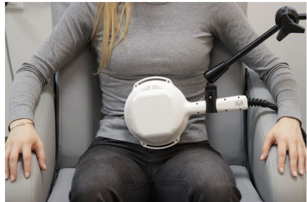
Figure 3: Body Core Strengthening with HITS® Technology – CoreRestore™.

With the CoreRestore™ program, handheld applicators are held in place of the patient's abdomen while the patient sits on the IntimaWave® chair [11]. This allows all components of the core - the pelvic floor muscles, back muscles and abdominal muscles to contract during a single treatment session, effectively strengthening and stabilizing the body's core. This is enabled by the system's Quattro™ modality, enabling treatment of up to 4 body regions at the same time. For smaller patients, a single applicator in addition to the IntimaWave® chair is used, while for larger patients, two applicators or a single extra-large applicator are placed on the abdomen.