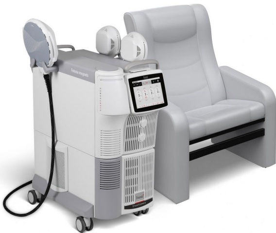
Figure 2: Fotona's StarFormer® magnetic stimulation device with IntimaWave® chair.

HITS® is available in Fotona's StarFormer® and QuantumStar™ magnetic stimulation devices, enabling the stimulation of several body regions during the same sessions using either handheld applicators, or applicators embedded in the IntimaWave® magnetic chair. IntimaWave® chair is unique in having the applicator embedded in both the chair's seat, enabling stimulation of pelvic floor, and backrest, enabling the stimulation of back muscles.